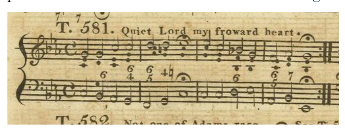
The first measures of a tune, composed by LaTrobe, as printed in the tune book he edited (1791).

Through the intervention Bishop Spangenberg LaTrobe switched to a simpler musical style where he strove "not to disturb, but to further the devotion of the congregation." In a collection of Moravian hymn tunes compiled for English audiences, LaTrobe stressed simplicity as the "grand source of beauty in church music" which enables one to "feel His divine presence with us." He lamented the "prevalence of depravity" (i.e. loud and showy instrumentation) which disturbed the connection to Christ. LaTrobe was a close friend of Franz Joseph Haydn, whom he visited often when the latter visited England. LaTrobe dedicated three piano sonatas to Haydn, in addition to composing clarinet concertos, duets and arias, and more than a hundred vocal pieces. www.moravianchurcharchives.org